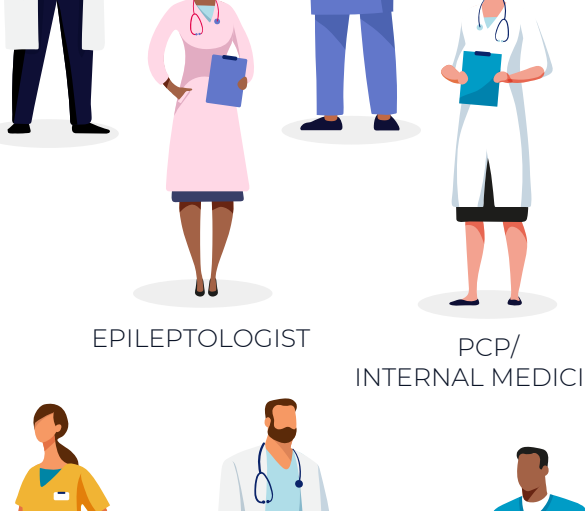
MOVEMENT DISORDER NP/PA SPECIALIST KOL'S